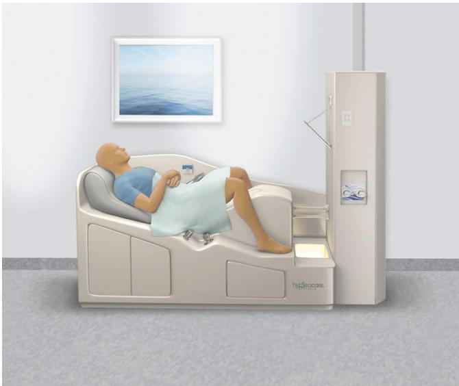
Figure 2. The HyGleaCare system features a reclined seat located above a sanitized basin. A nozzle is inserted rectally to provide continuous low-pressure irrigation, which is evacuated until lavage is complete.

adds to risk of adverse event in brittle or unhealthy colon. A swine study with Pure-Vu reported 100% adequate preparation (n=35), followed by a human study in 2016 (n=50), with 98% adequate preparation from a baseline of 31% [102,103].