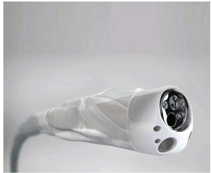
Figure 3. The Pure-Vu system sleeve fits onto standard colonoscopes for intraprocedural lavage. The hydrophobic sleeve features two large evacuation ports that are centrally located, and multiple small irrigation jets that are located peripherally.